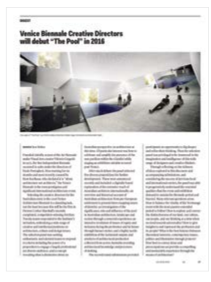
Article appeared in Architecture Australia Magazine in July 2015.