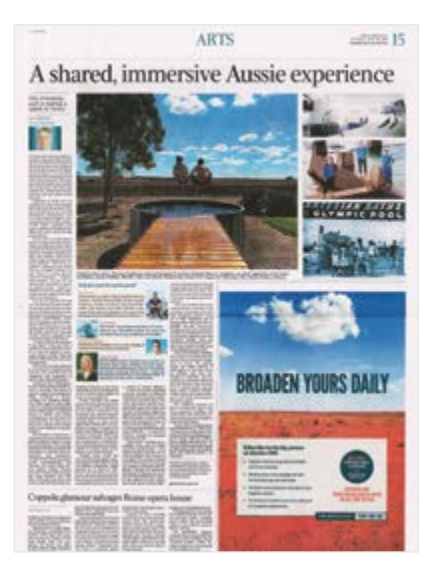
Article appeared in the Australian Arts section on Tuesday 24 May 2016.