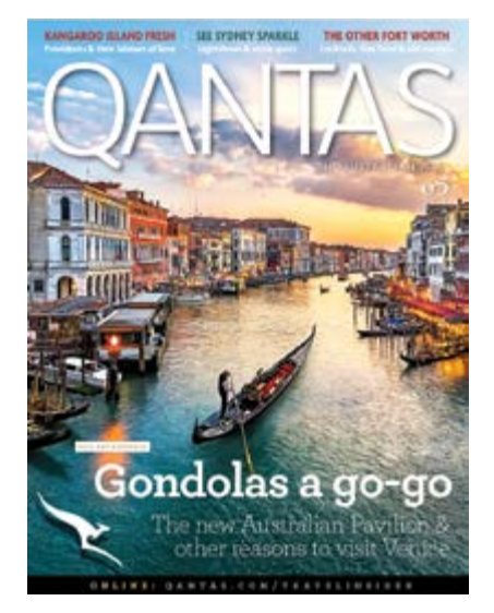
Featured on the cover of Qantas in-flight magazine Spirit of Australia, Gondolas a go-go and inside story, May 2015.